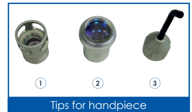
Tips for handpiece