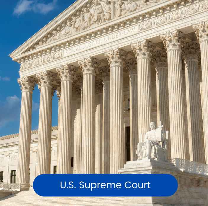
U.S. Supreme Court