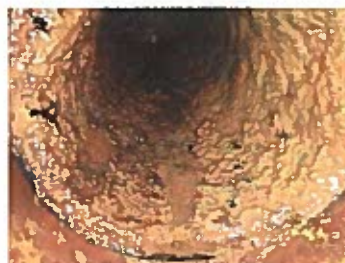
Start of ProMoss™ treatment

Nonfood Compounds (Category Code G5, G7)