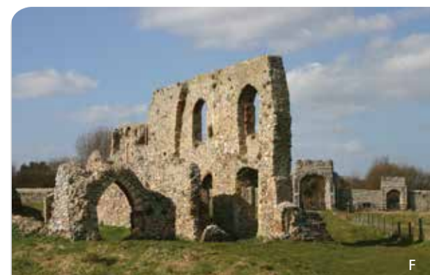
Images: Front cover – A cyclist pauses at Dunwich Heath. A. Dunwich Beach – An ever-changing place. B. Westleton – Cycling along the village street. C. Marsh Harrier – One of the many species of bird at Minsmere. D. Red Deer – Minsmere hosts a herd of these beautiful animals. E. Dunwich Heath – Heather and Gorse in bloom. F. Greyfriars Priory – One of the finest ancient monuments in Suffolk.

5 Greyfriars Priory is one of the most significant ancient monuments in Suffolk. What remains are the ruins of a medieval Franciscan priory. The ruins in the centre of the site used to be the refectory, whilst the impressive gate was once the main entrance. The site is now managed by the Dunwich Greyfriars Trust and is free to visit.