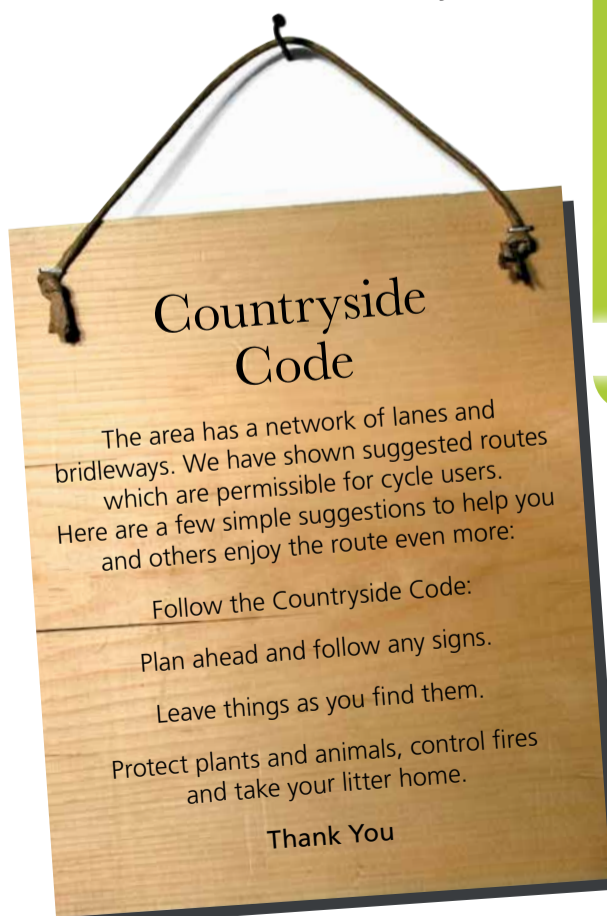
Images: A. Rendlesham Forest – Cycling through the forest. B. Sea Campion – A summer flower of the Suffolk Coast. C. Bawdsey Quay – A great destination for a cycle ride. D. Bawdsey Manor – The base for Radar research in the 1930s. E. Rendlesham Forest – Amongst the trees are beautiful clearings.