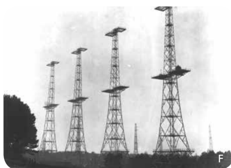
Images: Front cover – Admiring the view at Bawdsey Quay; A. Rendlesham Forest – Many trees are grown for timber. B. Crossbill – Look out for these birds in Rendlesham Forest, usually flying close to treetop height. C. Suffolk Punch Horses - Ploughing a straight furrow. D. Shingle Street – Quirky houses. E. Shingle Street - Lots of shingle! F. Bawdsey Radar – In the 1940s, the tall radar masts towered over Bawdsey Quay.

4 Bawdsey was the location of the world's first fully operational Radar Station. The team of research scientists working on Radar moved to Bawdsey Manor in 1936. The station became known as RAF Bawdsey and huge transmitter and receiver towers were built. The station was instrumental in detecting Luftwaffe raids during WWII. On some Sundays and Bank Holidays, you can visit the Bawdsey Radar Museum to find out more. Bawdsey Quay is a beautiful location to stop and enjoy the Deben estuary.