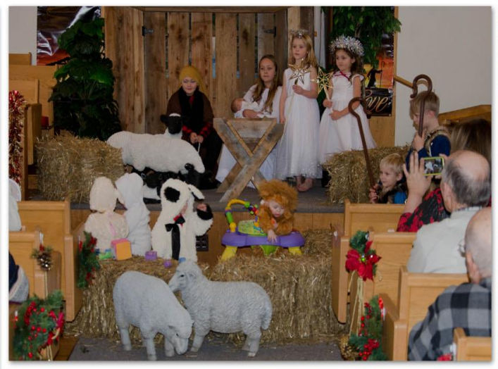
Christmas Service Sunday, December 24th