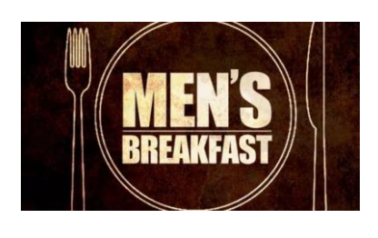
No Men's Breakfast in April. However, please join us at the Men's Retreat in Fredric! April 13-14