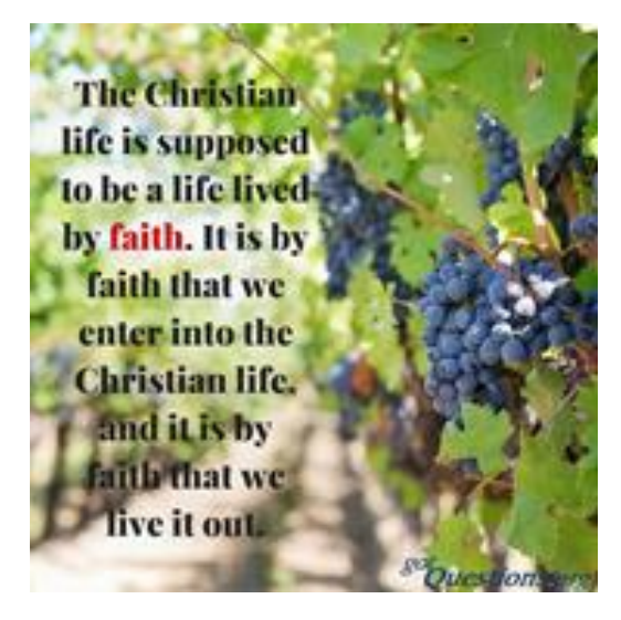
Submitted by Barbara Trombley

"Therefore we do not lose heart. Though outwardly we are wasting away, yet inwardly we are being renewed day by day. For our light and momentary troubles are achieving for us an eternal glory that far outweighs them all. So we fix our eyes not on what is seen, but on what is unseen, since what is seen is temporary, but what is unseen is eternal." –2 Corinthians 4:16-18