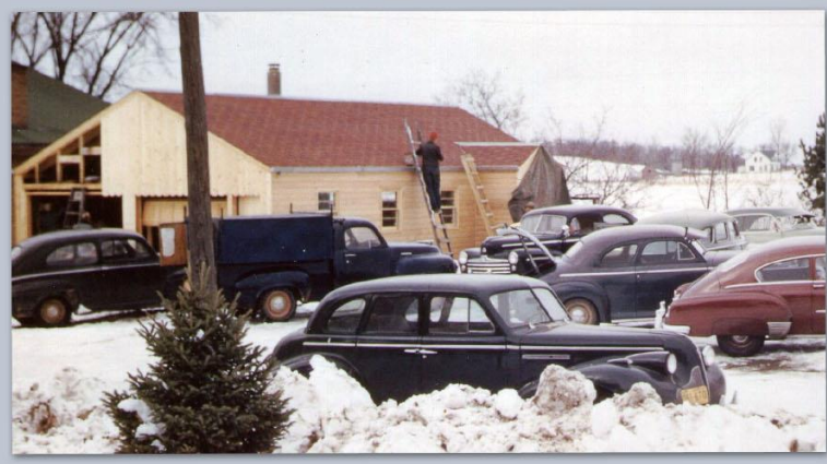
Being built in 1952

Last year, Eureka Baptist Church held a garage sale during River Road Ramble. It was decided that the proceeds from the sale would go towards fixing the Annex building. $1,000 was raised from that sale. Work has now started on the exterior of the building. The building was roofed last fall and new windows, doors and garage door are currently being installed. The improvements will make the building more functional for gatherings and events. The Annex was built in 1952 because of crowded conditions for Sunday School.