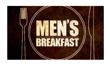
Men's Breakfast Saturday, June 9th 8:00am