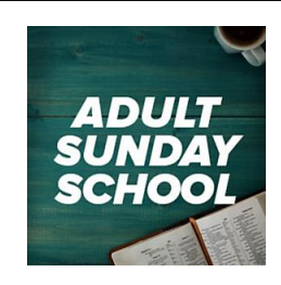
Adult Sunday School Sunday Mornings 9:00am