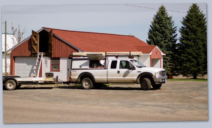
Working on the building 2018