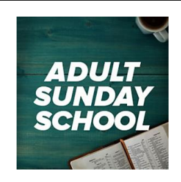
Adult Sunday School Sunday Mornings 9:00am