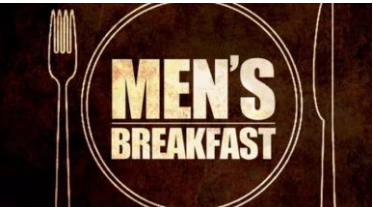
Men's Breakfast Saturday, August 13 8:00am