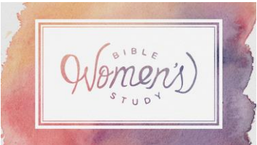
Women's Bible Study Saturday, August 6 9:00am