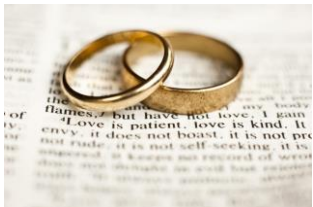
Marriage Bible Study No study this month Will resume in September