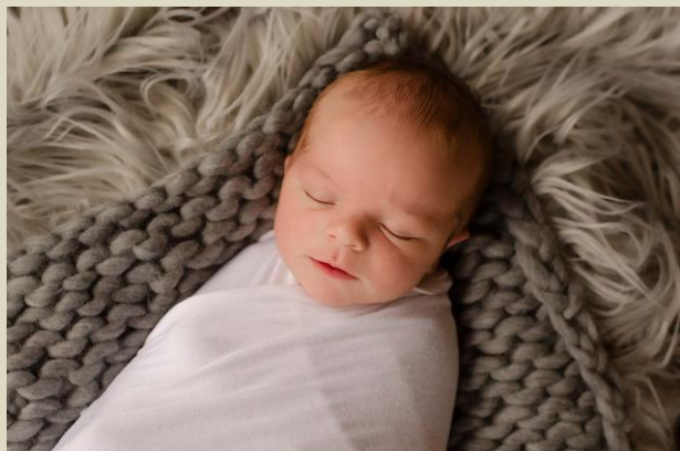
Wyatt Russell Hall