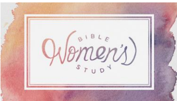
Women's Bible Study Summer Break Will resume in early fall