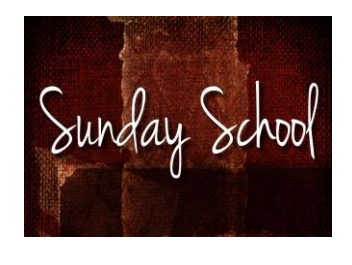
Sunday School Sunday Mornings 9:00am