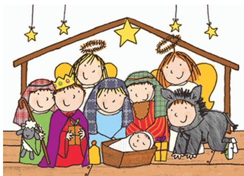
Children's Nativity Program Sunday, December 17 During Morning Service