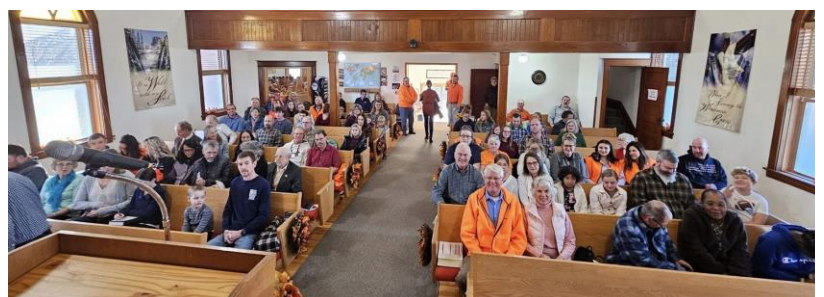
Showing off some blaze orange for opening weekend of deer hunting!