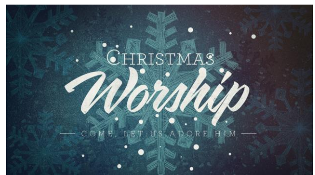
Christmas Service Sunday, December 24 th 9:00am Cookies/Treats 10:00am Christmas Service