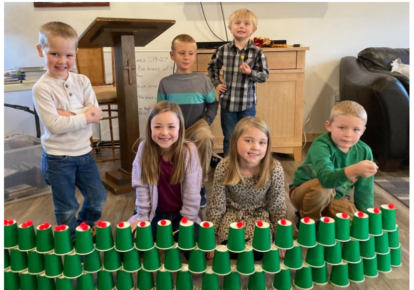
Children's Church wrapped up our study of the Old Testament by rebuilding a portion of the wall around Jerusalem, as described in Nehemiah.