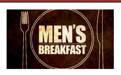
Men's Breakfast Saturday, February 9th 8:00am