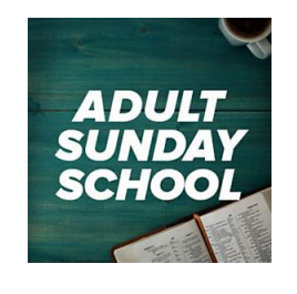
Adult Sunday School Sunday Mornings 9:00am