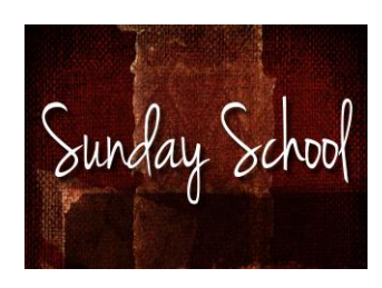
Sunday School Sunday Mornings 9:00am