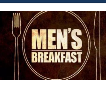
Men's Breakfast Saturday, February 10 8:00am

Women's Group Saturday, February 3 8:00am