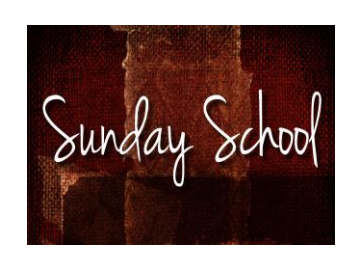
Sunday School Sunday Mornings 9:00am