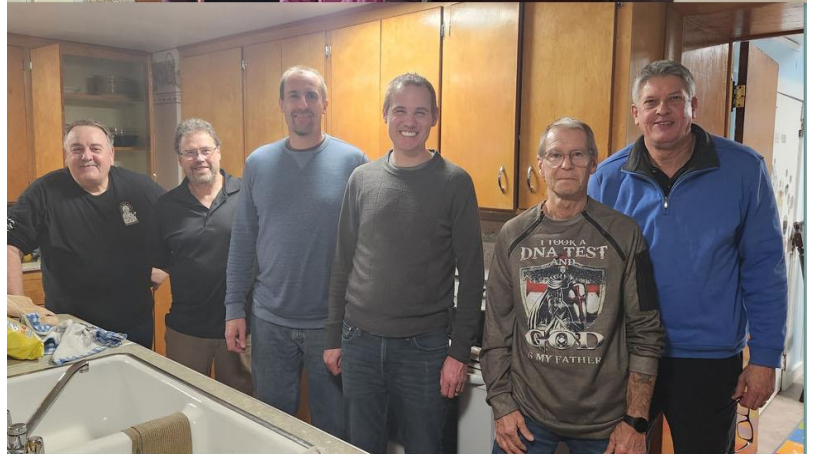
THANK YOU TO THE MEN THAT CLEANED UP AFTER THE EVENT!