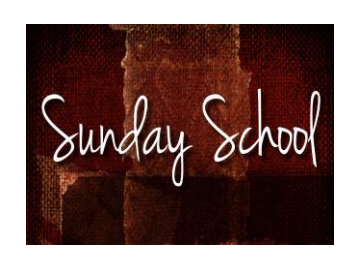
Sunday School Sunday Mornings 9:00am