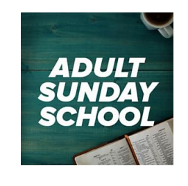
Adult Sunday School Sunday Mornings 9:00am