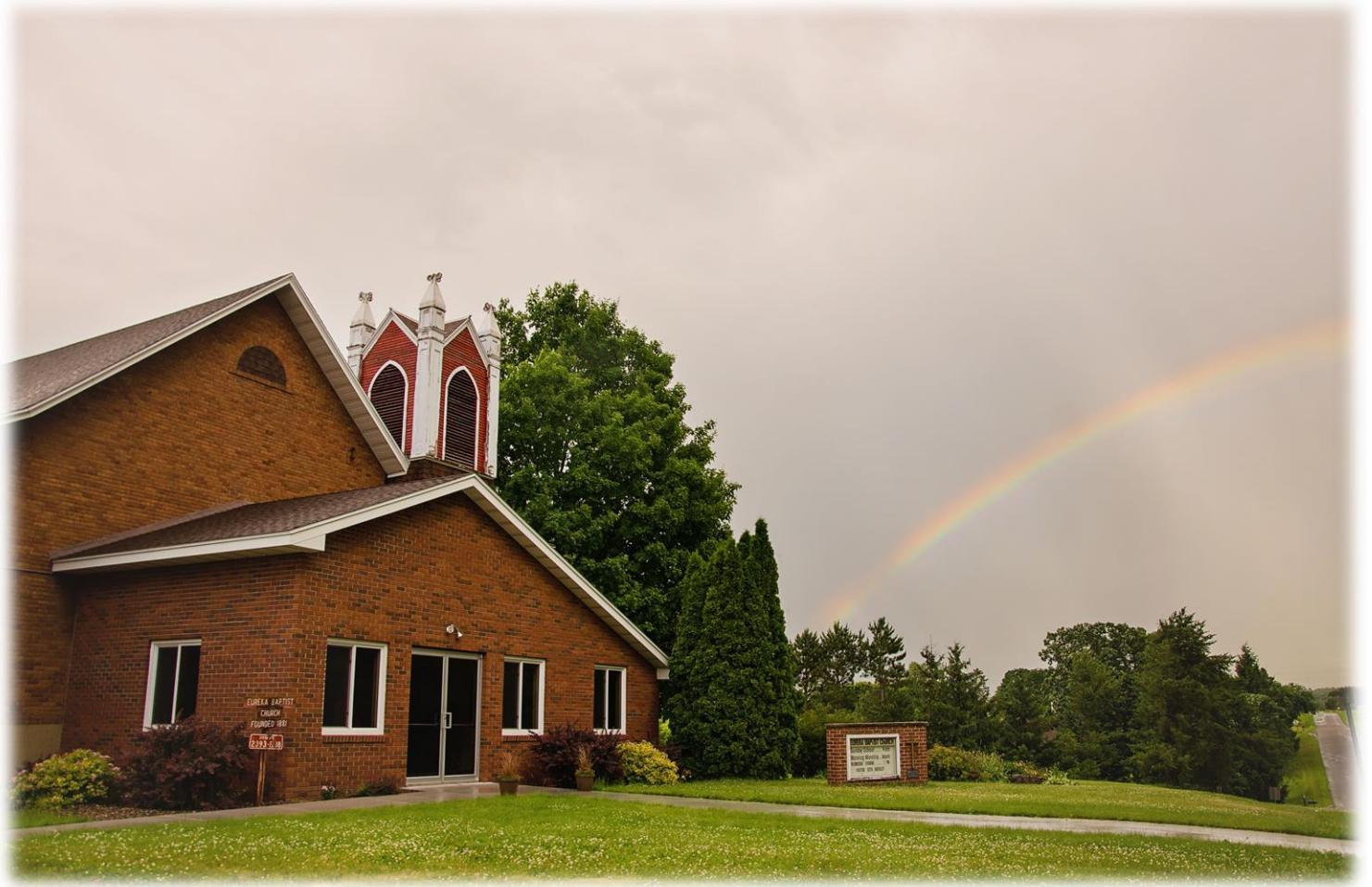
Eureka Baptist Church 2393 210th Avenue St. Croix Falls, WI 54024