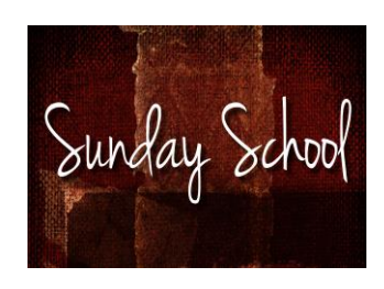
Sunday School Sunday Mornings 9:00am