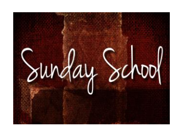
Sunday School Sunday Mornings 9:00am