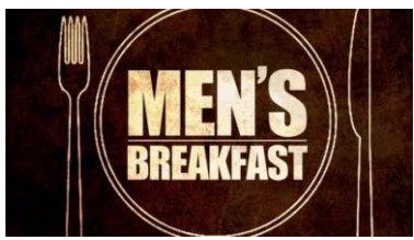
Men's Breakfast Saturday, November 12 8:00am