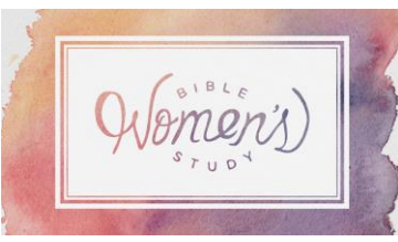
Women's Bible Study Saturday, November 5 9:00am