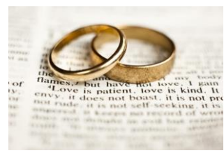
Marriage Bible Study Monday, November 7 7:00pm