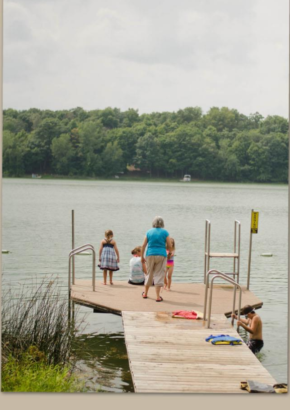
Eureka Baptist Church had its annual Church Picnic at Skonewood Christian Retreat on Sunday, August 19<sup>th</sup>. It was a beautiful day with lots of visiting, playing and swimming.