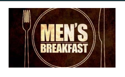
Men's Breakfast Saturday, September 11 8:00am