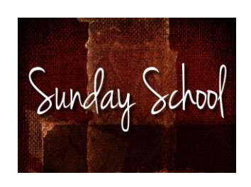
Sunday School Sunday Mornings 9:00am