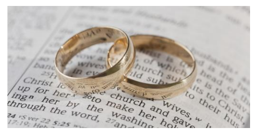
Due to Labor Day, Marriage Bible Study will be the following week. Monday, September 12 7:00pm