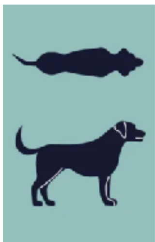
Ideal body condition

While Cash certainly loves his family, he makes it known when he is not ready to leave daycare. If you need a giggle, check out the video on our website. Our Dog Spotlight appears at the bottom of our Dog Daycare Page. We hope you enjoy this new feature.