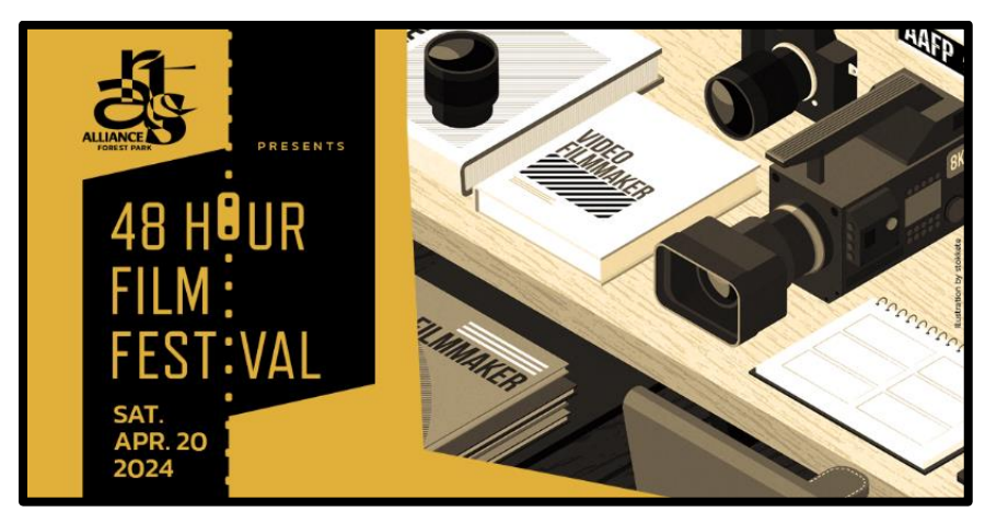
Red Carpet Gala and Film Festival Saturday, April 20 St. Bernardine's Fearon Hall, 815 Elgin Avenue in Forest Park Screening will begin at 7:00

Make Saturday April 20 a full day on Madison Street by joining the Chamber of Commerce Spring Wine Walk with Art Stops before you attend the 48 hour Film Fest Gala. Sipping wine is always better when you can also enjoy the work of local artisans. Buy a ticket to taste the wine and art <u>here</u>.