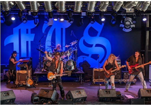
Ron Keel Band at the Full Throttle Saloon in 2021

“At a gig like this, we play everything from the “Keeled” tunes to all the southern rock classics from “South X South Dakota” [Ron Keel Band’s 2020 southern rock tribute album] – we’ll see you at the Full Throttle Saloon at the Sturgis Rally!”