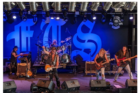
Ron Keel Band at the Full Throttle Saloon in 2021

"At a gig like this, we play everything from the "Keeled" tunes to all the southern rock classics from "South X South Dakota" [Ron Keel Band's 2020 southern rock tribute album] - we'll see you at the Full Throttle Saloon at the Sturgis Rally!"