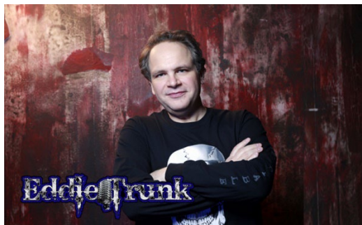
Eddie Trunk joins the KRFRK schedule

Popular radio host, TV personality, author and event host Eddie Trunk is bringing his show to http://KRFRKradio.com . “Eddie Trunk Rocks” will debut on the station on Saturday, March 26 th , at 5:00 PM Eastern, with an encore broadcast each Tuesday at 11:00 AM Eastern.