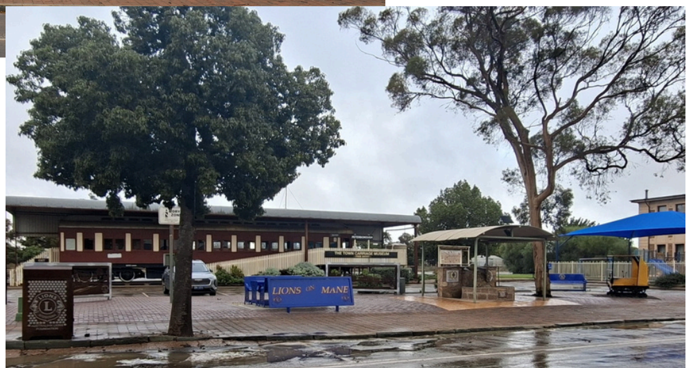
Lions on Mane - now