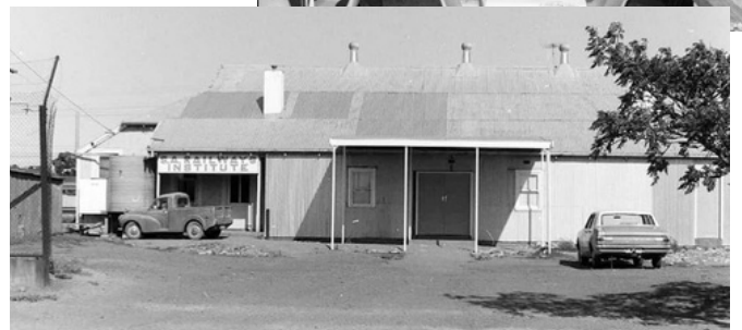
"Archival photos of the SARI Hall"