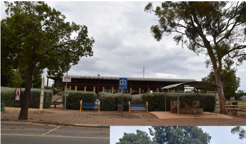
Lions on Mane - before

The completed precinct now stands as a testament to what can be achieved when community spirit, volunteerism, and a shared vision come together. It is a place for residents and visitors alike to relax, reflect, and appreciate both the history and future of Peterborough.