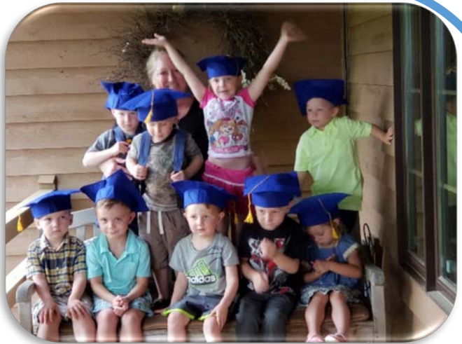
PCHP 2018 Graduates