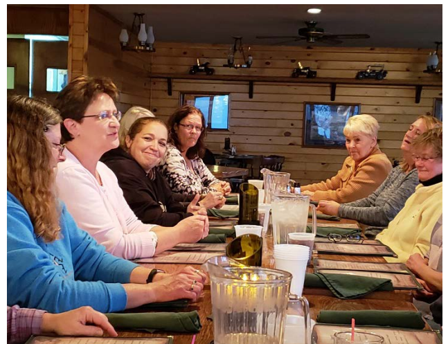
Learning Together Board and Staff Retreat