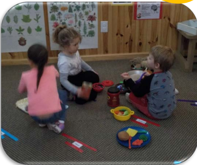
The girls set out a picnic and were soon joined by some company.