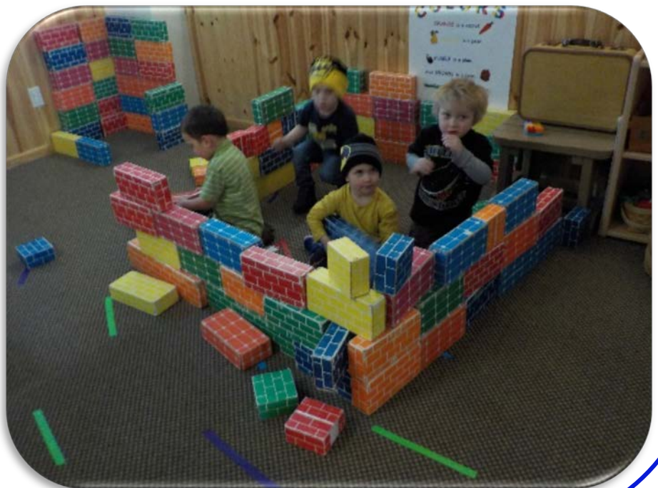
The boys built a big boat and are headed down river. This collaborative effort required a good bit of ability to use their language skills, work together, and follow a plan.