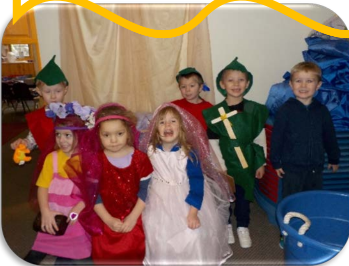
Just another day at the castle!