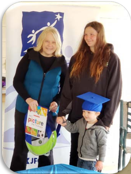
PC+ 2019 Graduates

In 2019 - 23 Families were served with a ½-hour visit twice a week. Program runs mid-September to the end of May. This is a 2-year program.