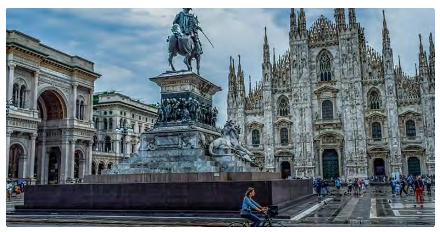
Burdett & Cynthia Forter - Final Itinerary Copy Nov 4, 2019 - Nov 15, 2019

941-960-7011 tours@italiadolcevita.com http://www.italiadolcevita.com