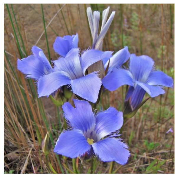
Fig 2. Fringed Gentian flowers

The first of these, Fringed Gentian ( Gentianopsis virgata ) is one of three members of the Gentian family to grow in the park but by far the showiest and most common of that group. It grows close to the water on alvar, cobble or marshy ground, in areas that are fairly wet for at least part of the year. Measuring 12 to 15 inches in height, it has one of the most striking flowers of any plant at Misery: at one to two inches across, its four deep blue fringed petals are arranged in the shape of a cross (Fig. 1 and 2).