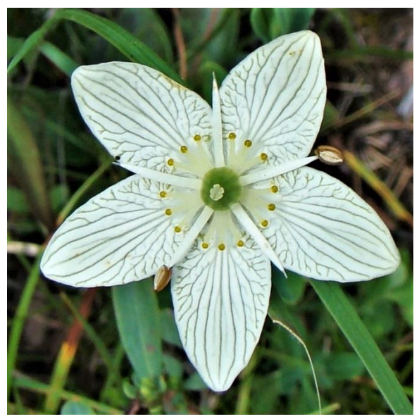
Fig. 4: Perfect symmetry

The second plant we will focus on grows in similar environments and is often found side by side with gentians. Grass of Parnassus ( Parnassia glauca ) is a member of the Saxifrage family.