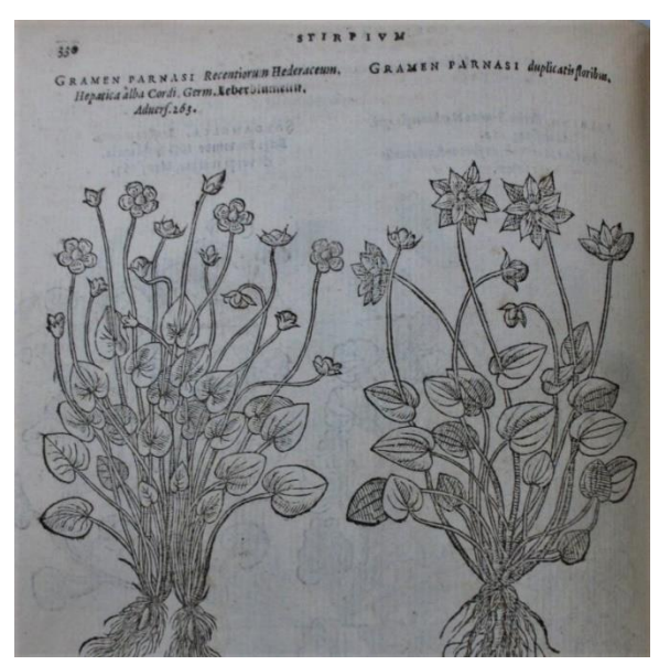
Fig. 7 From Gerarde's Herball or Generall Historie of Plantes 1633.

A comment about the odd name of this plant: why is it referred to as a grass when it clearly isn't, and what does it have to with Mount Parnassus in Greece? Common names of plants are an endless source of confusion. Apparently, the earliest reference to this plant is in the Materia Medica of Pedanius Dioscorides of the first century AD; the long and convoluted history of the plant ad its name can be followed at this website: https://stories.rbge.org.uk/archives/26399