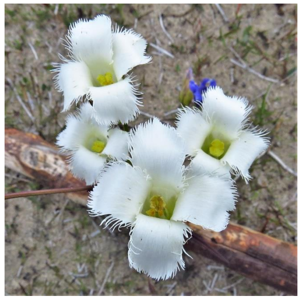
Fig. 3 Fringed Gentian, rare white form