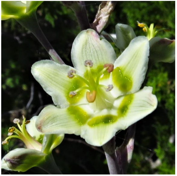
Fig. 10 Death Camas flower close-up

shaped style in the centre of the flower is surrounded by six arching stamens with green to purple to orange tips. Each petal is adorned with a thick greenish-yellow heart-shaped nectar gland, forming a ring around the centre of the flower (Fig. 10). The leaves are long and lance-shaped. Formerly considered a member of the Lily family, Death Camas has recently been reclassified as belonging to the Trillium family. Evidence suggests that the pollen and nectar are even toxic to many pollinators, meaning the plants rely on certain "specialized" pollinators who have developed an immunity to the toxins.