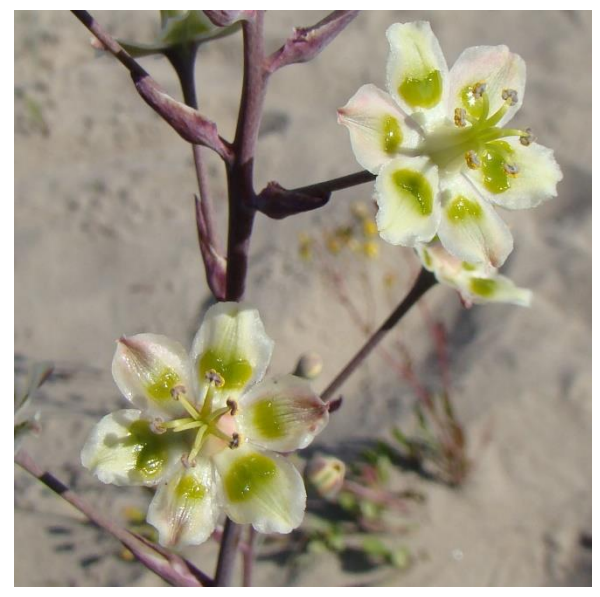
Fig. 9 Death Camas flowers

can be found further inland than the other two plants described above. Look for it in mid to late August on rocky or sandy shorelines and also along the trees and meadows along the water's edge. As the common name implies, all parts of the plant are extremely toxic and can in fact be deadly to humans and to livestock.