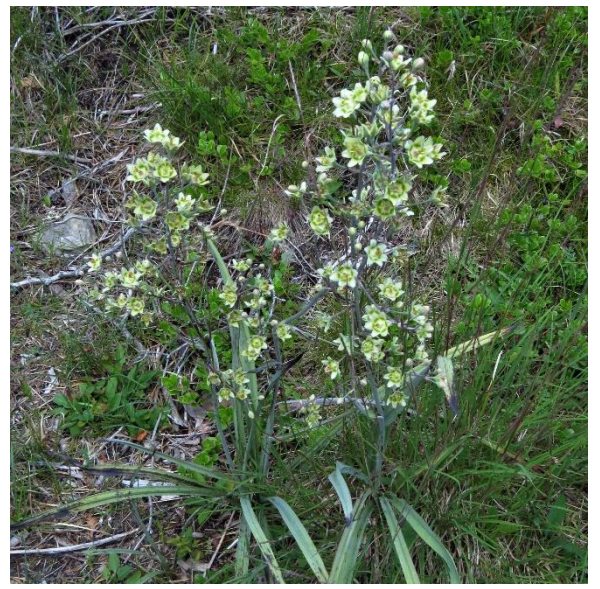
Fig. 8 White or Death Camas plants

The third of our late summer beauties is less showy than the other two but is well worth a closer look. White, or Death Camas ( Zigadenus elegans , aka Z. glaucus and Anticlea elegans ) grows quite profusely along the park's shorelines and