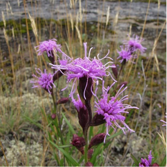
Flower and camera enthusiasts photographing Cylindrical Blazing Stars, Aug. 14th

included more than 50 flowering plants that grow along he woods, alvars and shorelines of this beautiful trail!