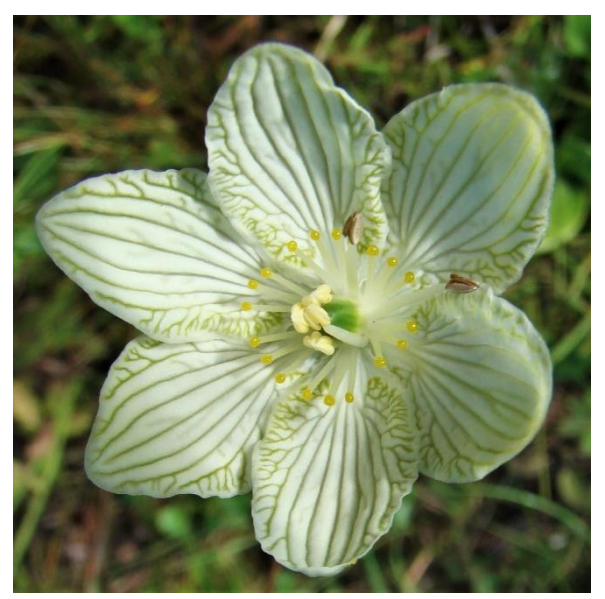
Fig. 6 Grass of Parnassus, double-flowered form.

They could be vestigial remnants that once produced pollen, or they could have evolved solely to attract pollinators to the real stamens. These radiate out between each group of three false stamens and neatly separate the five petals. Each flower, about an inch across, sits singly atop a long narrow and glabrous (smooth) stem about 10 to 12 inches tall. The leaves, smooth, leathery and egg-shaped, grow in a rosette at the base of the stem (Fig. 5). Sometimes plants with six or even seven petals can be found (Fig. 6).