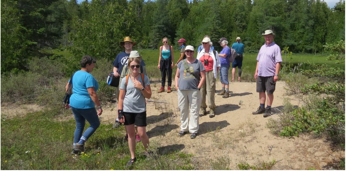
Group by west side vernal pool, Aug. 6th.