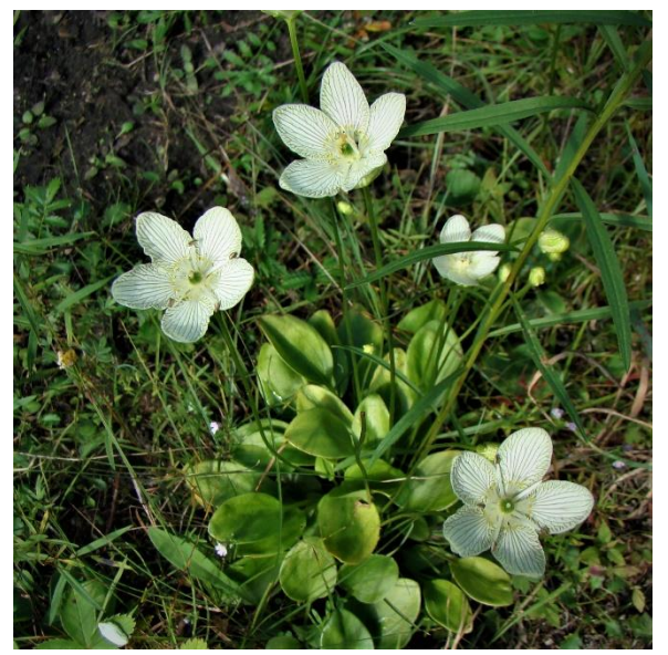
Fig. 5 Grass of Parnassus Plants

Its strikingly marked star-shaped flowers are a picture of perfect symmetry (Fig. 4). The five white petals are decorated with deeply embossed, dark green veins. The green style and ovum are perfectly centred where the five petals meet; surrounding this ball-shaped structure are 15 "false stamens" – three for each petal – that radiate out from the base of the ovum, each one ending in a shiny green ball. Experts are divided on the function of these sterile structures: