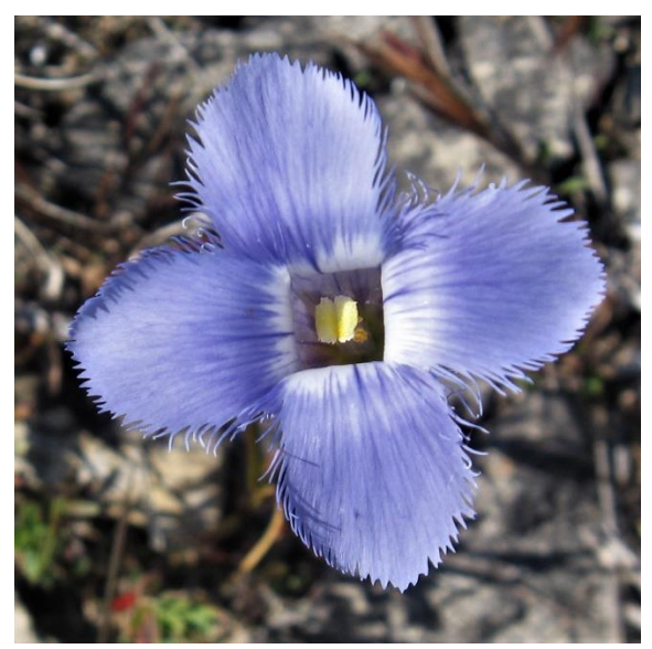
Fig. 1 Fringed Gentian, flower close-up

The dramatic parade of flowering plants at Misery Bay has peaks and valleys of intensity from early spring to late fall. Things start slowly in late April-early May with such modest little blooms such as Spring Whitlow Grass, Early Saxifrage, Creeping Buttercup, Lyre-leaved Rockcress and a few flowering shrubs. Things reach a crescendo by the end of May-early June, with the various Ladies' Slippers and Coral Root orchids coming on line, as well as Columbines, Wild Chives, Indian Paintbrush, Blue Flag Iris and the iconic Manitoulin Gold exploding onto the scene to paint each of Misery Bay's landscapes in a riot of colour. The