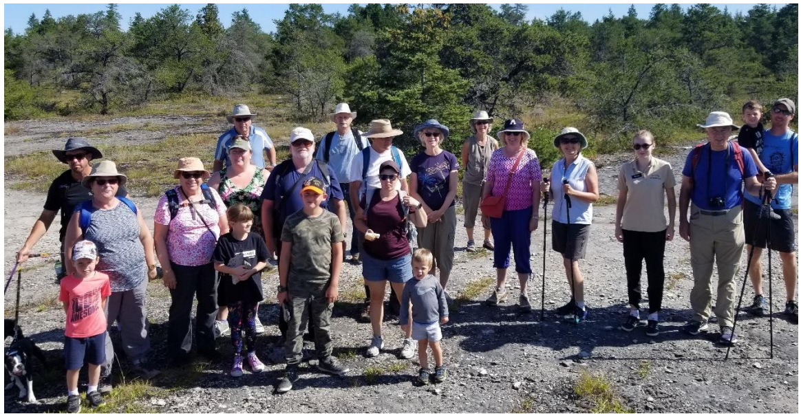
West side alvar, Aug. 20<sup>th</sup> – fun for all ages!