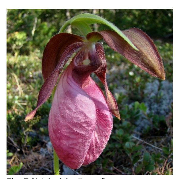
Fig. 7 Pink Lady's-slipper flower

Pink Lady's-slipper ( C. acauly ), also known as Moccasin Flower, is a bit different from the other members of the genus. The slipper, instead of having a round opening, has a slit-like entrance formed by the two folded halves of the labellum.