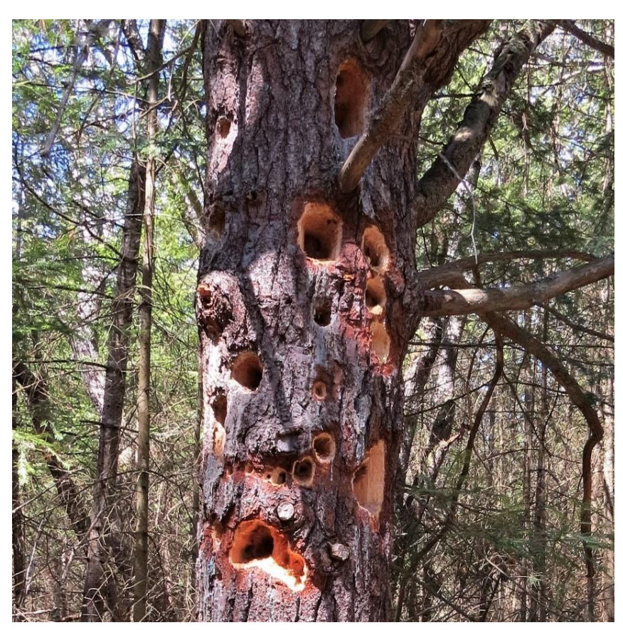
Woodpeckers gone wild!