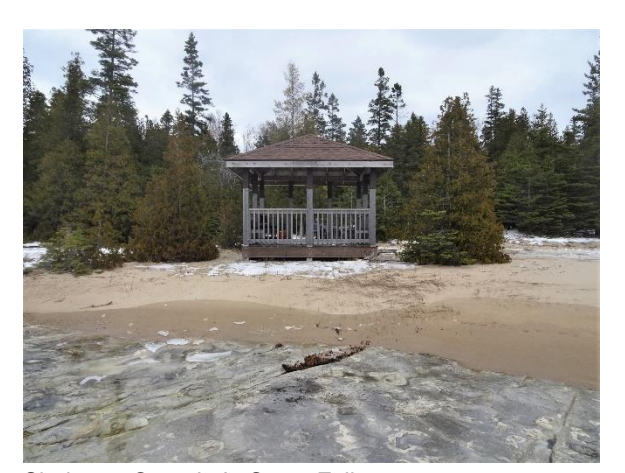
Shelter at Saunder's Cove, Fall 2019

It is still high and dry, but the lake is much closer to it now – and this was on a calm day! It may be safe for now, but it still has to be permanently established onto that location, or even little further inland. We are hoping to get that done later this year.