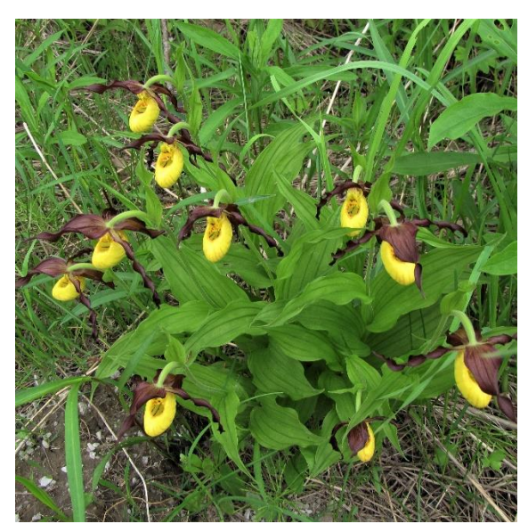
Fig. 4 Small Lady's-slipper plants

Most plants do not attain this size and it is best to rely on other features to distinguish the two varieties. The Small Lady's-slipper has flowers that tend to be not only smaller, but noticeably narrower in shape. The sepals, as well as the lateral petals are a darker, almost maroon colour; the coils on the petals tend to be quite a bit tighter than those of the larger variety (see Fig. 4 and 5).