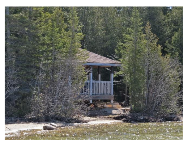
Our Friends Shelter now at water's edge again

It is still high and dry, but the lake is much closer to it now – and this was on a calm day! It may be safe for now, but it still has to be permanently established onto that location, or even little further inland. We are hoping to get that done later this year.