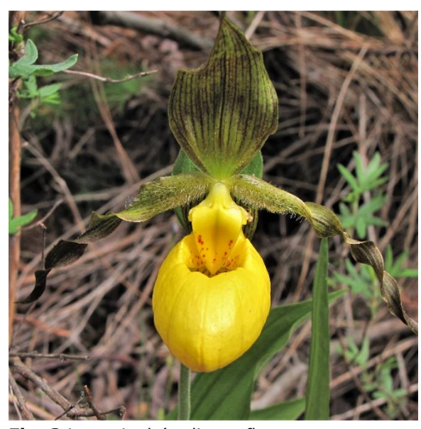
Fig. 3 Large Lady's-slipper flower

The earliest Lady's-slipper to bloom in the park is Cyprepedium parviflorum, the Yellow Lady's-slipper. It is the most common Lady-slipper on Manitoulin Island and can be found in many different habitats. There are two varieties that bloom here - Large (var. pubescens) and Small (var. parviflorum) and they can be seen from mid-May to late June throughout the park. It is not always easy to tell them apart - depending on the growing conditions, there can be guite a bit of size variation within each variety and, to further complicate things, the two are known to hybridize. But under ideal conditions, the Large Lady's-slipper is