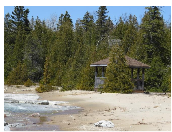
Shelter at Saunder's Cove, Spring 2020

The Shelter at Saunders Cove is still okaybut just – as some storm crest waves have washed very close to it. Note that the flat rocks in the foreground of the first picture below are completely under water now! It promises to be a most interesting year!