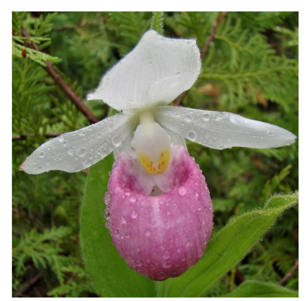
Fig. 11 Showy Lady's-slipper flower

one commentator describes it as a white goblet that has been stained by wine spilling out over the rim. Coming across a clump of these flowers growing together is a sight not soon forgotten.