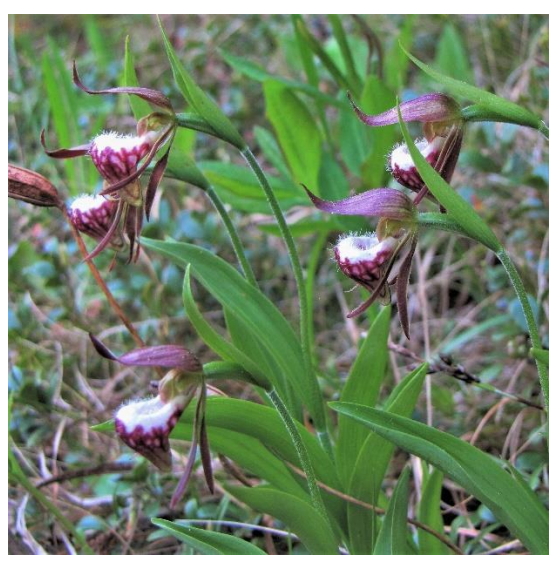
Fig. 8 Ram's-head Lady's-slipper plant

Ram's-head Lady's-slipper ( C. arietinum ) (Fig. 8-9-10) is best seen at the same time and place as the Pink Lady's-slipper. This little orchid is however notoriously difficult to spot, in spite of its striking