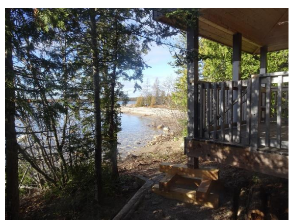
New location, 40 ft. back from water

almost 15 inches from May of 2019. This is having quite an impact on our Coastal Trails and of course, our two shelters. Most sections of the Coastal Trails have been closed because of this high water. The inland trails are in remarkably good shape, with only a few major tree-falls across them. Anything minor was cleaned up by Our Friends as they walked the trails.