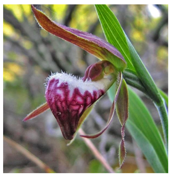
Fig. 9 Ram's-head Lady's-slipper flower

Ram's-head Lady's-slipper has an S3 (uncommon) status in Ontario and is considered vulnerable due to its limited range, which is mostly concentrated in the sandy soils of Lake Huron shores. There seems to be a fairly healthy population on