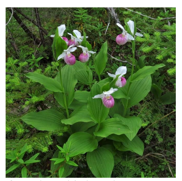
Fig. 10 Show Lady's-slipper plants

rather bushy appearance. The flower is the crowning glory – a large white slipper up to 2 inches long with variable markings ranging from pale pink to dark burgundy;