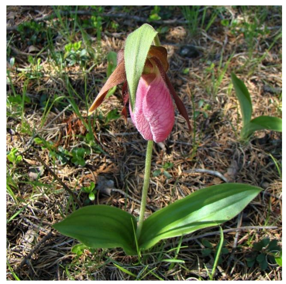
Fig. 6 Pink Lady's-slipper plant

Pink Lady's-slipper ( C. acauly ), also known as Moccasin Flower, is a bit different from the other members of the genus. The slipper, instead of having a round opening, has a slit-like entrance formed by the two folded halves of the labellum.