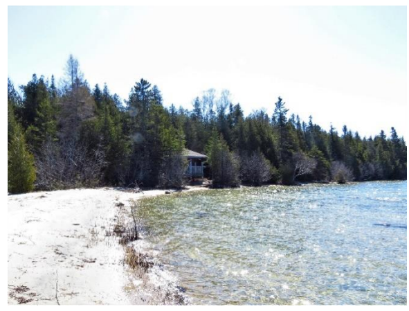
Shrinking beach at Misery Bay

The Shelter at Saunders Cove is still okaybut just – as some storm crest waves have washed very close to it. Note that the flat rocks in the foreground of the first picture below are completely under water now! It promises to be a most interesting year!