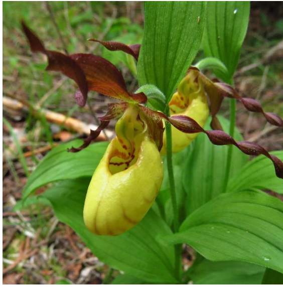
Fig. 5 Small Lady's-slipper flower