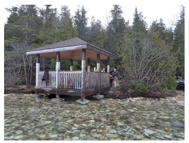
Our Friends Shelter before moving last Fall

You simply have to love nature. In this crazy mixed up world of ours, nature, and all that it offers, just keeps on marching along. It really does not stop for anything – you can count on it! This past week on Manitoulin, the bird migration was in full flying-north mode. We welcomed back birds like orioles, rose breasted grosbeaks, hummingbirds and a very special visitor, a female and male painted bunting (they are way off course and belong much further south).