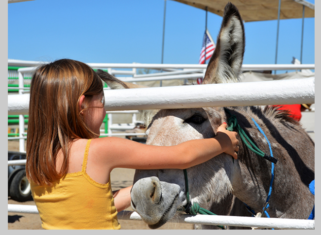
Adopt a mustang or wild burro. Learn more about upcoming adoption events.