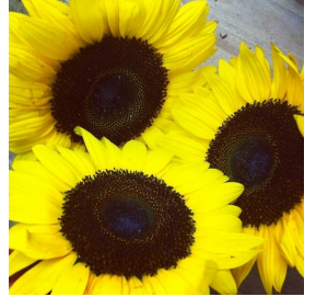
Country Floral & Gifts, Junction City

Show your KHC member card at checkout and receive valuable discounts from these merchants.