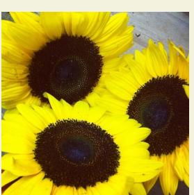
Country Floral & Gifts, Junction City