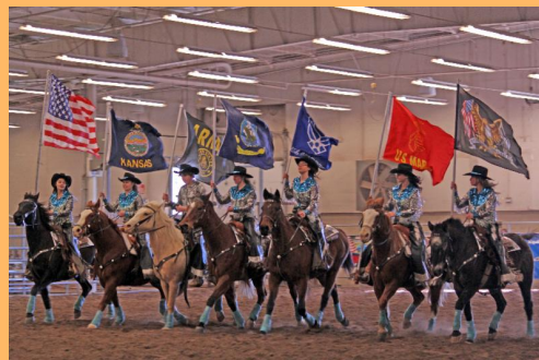
Silver Buckle Drill Team

To learn more about the scholarship application Click Here