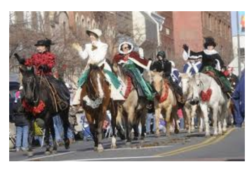
CLICK HERE to Join the Largest Equine Network in KANSAS!