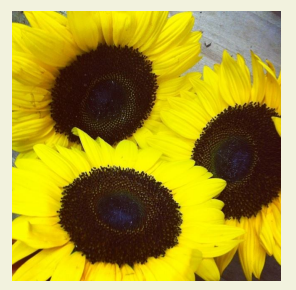
Country Floral & Gifts, Junction City