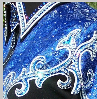
Kansas Classic Horse Show

There's something for everyone from Cowboy Dressage, barrel racing, halter, trail, pleasure, lead-line and much, more. Plus prizes for the best-dressed stalls. There will be a horse judging contest on Saturday morning sponsored by the Cloud County Community College.