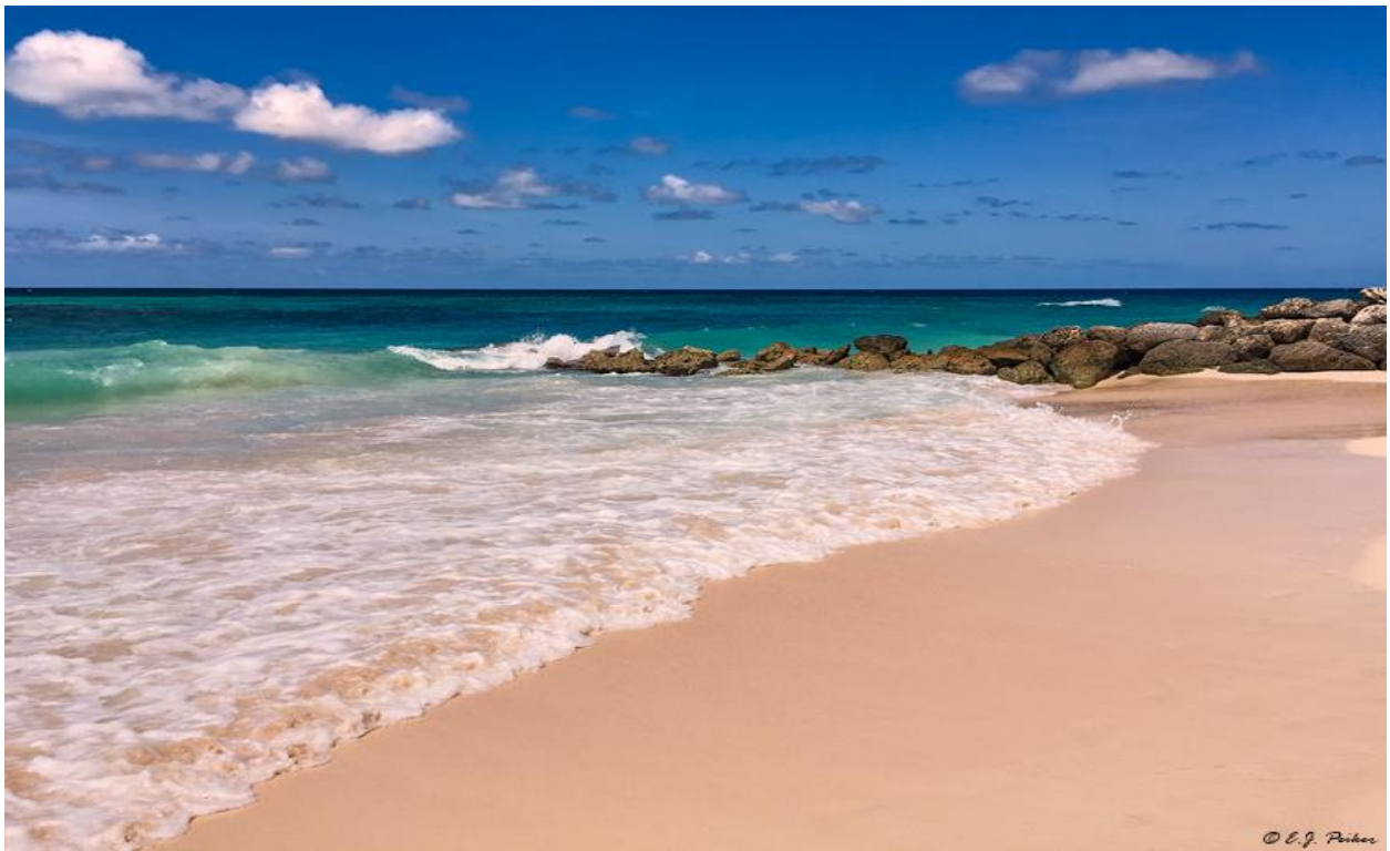
Blessings & Abundance

Slowly inhale through your nose with your mouth closed for five counts. Slowly hold the breath in for five counts. Then, slowly exhale for five counts. Do this five times; or, repeat again if necessary.