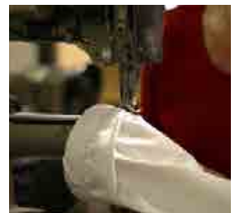
Made in America with American materials

Distributor contact Email: ventas@cepedasparts.com Tel: (55) 54336626