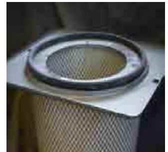
Replacement filters for all major OEMs