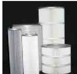
Thousands of available cartridges