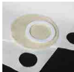
Custom Die Cutting