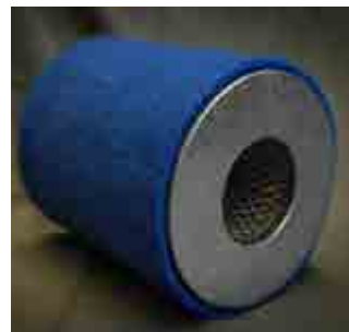
Sewing line for filter wraps