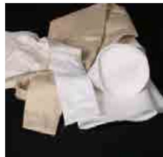
Dust Collection Bag Filters