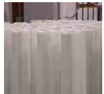
The filters you need- when you need them!