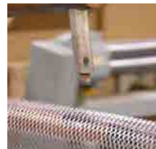
Precision, high quality welding and manufacturing