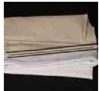
Envelope Style Filters