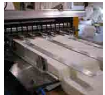
Adjustable pleated media