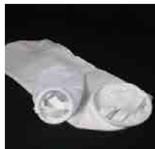
Liquid Filter Bags