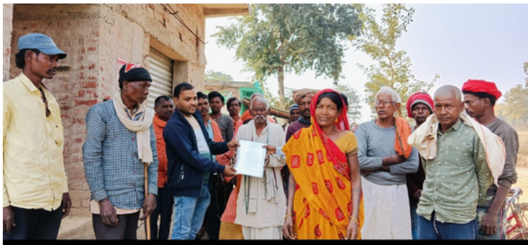
CFR Entitlement handover to Community with Forest management Committee