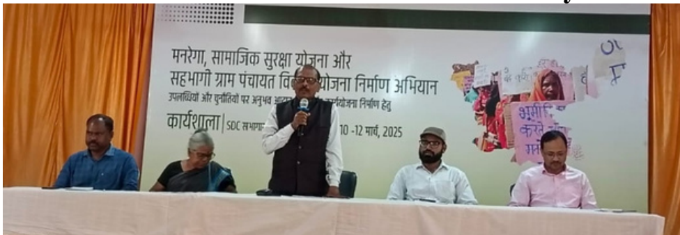
Participation on State level convocation on Ration, pension, MGNREGA

Khamdiha, Jharkhand, India 632r+m3, Khamdiha, Jharkhand 822124, India Lat 24.200745° Long 84.003892°