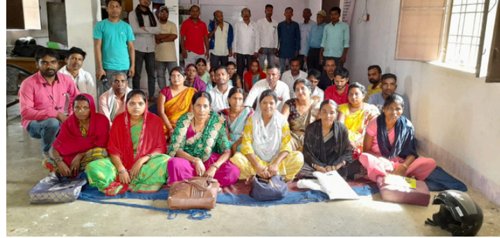
Citizen leaders post training Group Photo