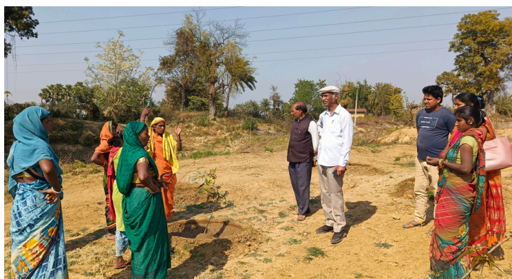
MGNREGA site visit and interaction with workers