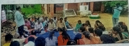
कार्यक्रम में उपस्थित स्वतंत्रता सेनानी के परिवार.