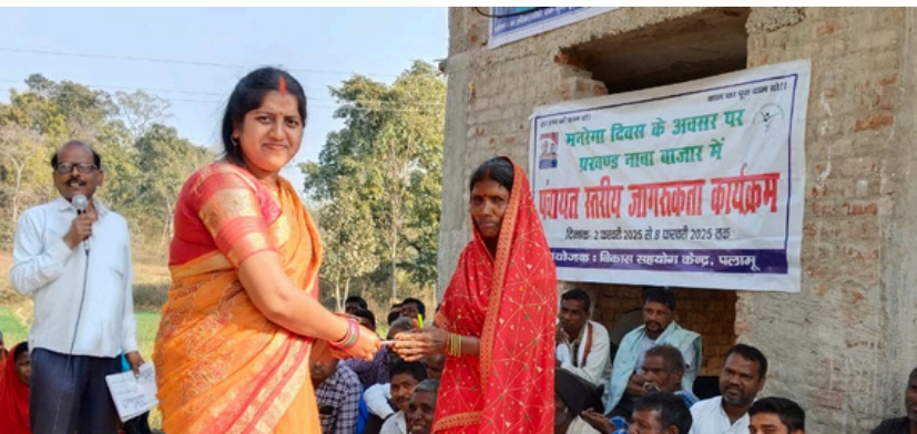
Prize to majdoor on completion of 100 days in MGNREGA