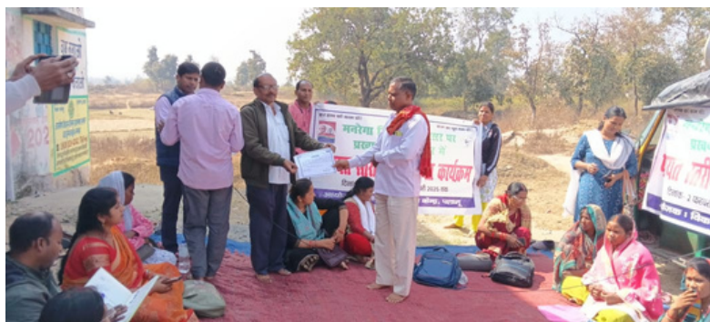
MGNREGA Divas celebration