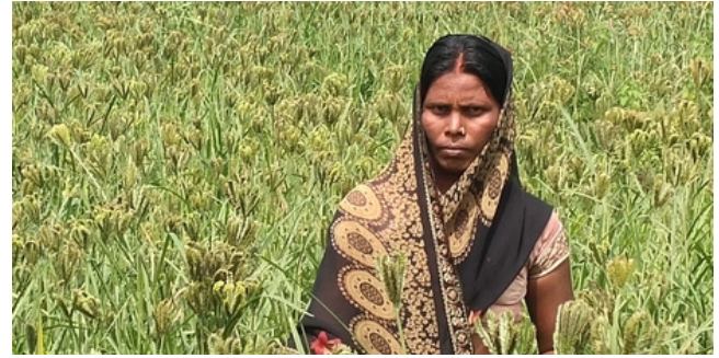
millet farmer photo