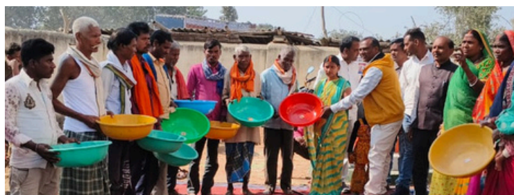
Prize distributin to Mjdoor - mgnrega Day