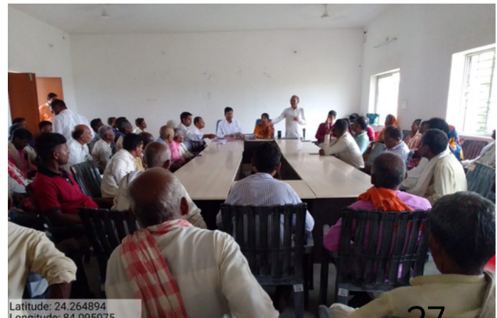
community group photo for CFR entitlement

Latitude: 24.264894 Longitude: 84.095075