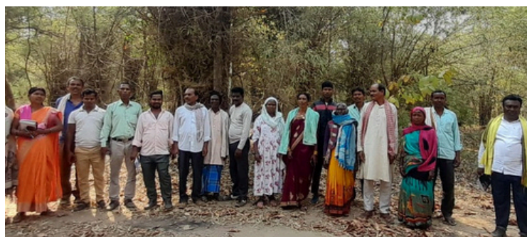
Exposure visit of Citizen leaders to Maharashtra