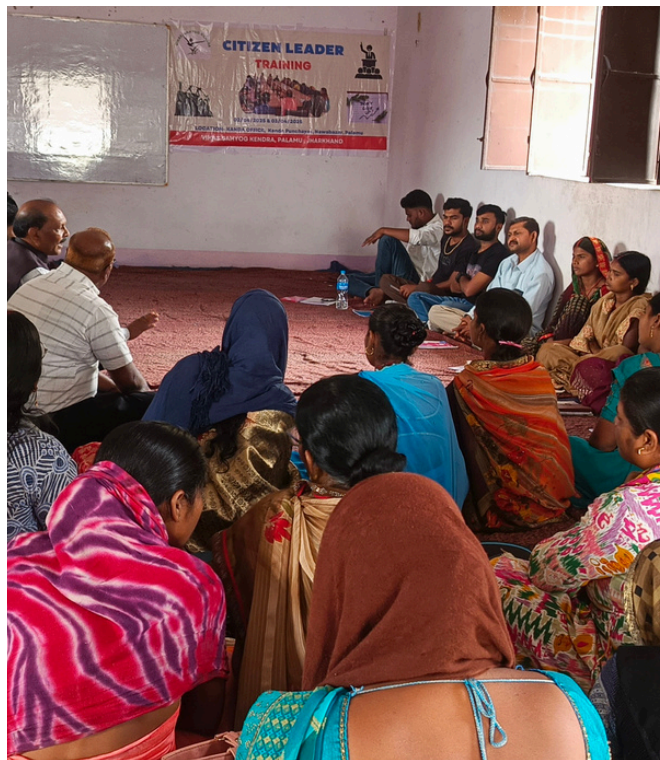
Citizen leaders Capacity building