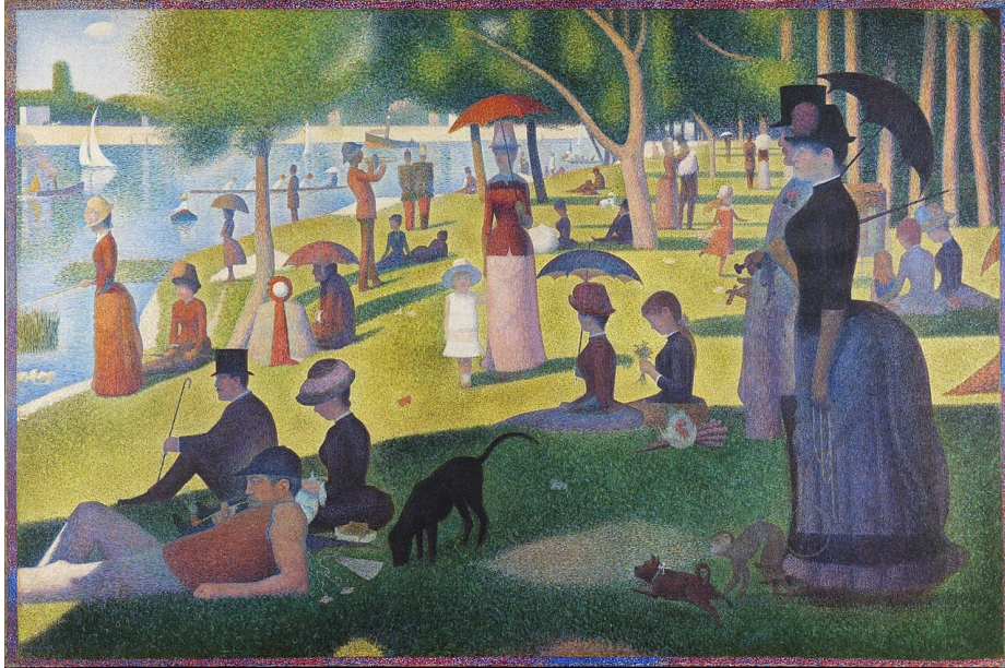
Georges Seurat: Un dimanche après-midi à l'Île de la Grande Jatte