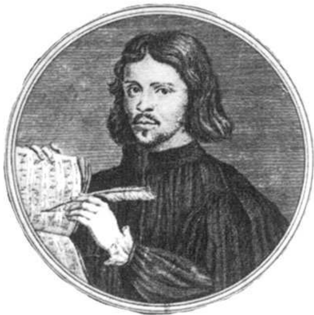
Thomas Tallis (1510 – 1585)